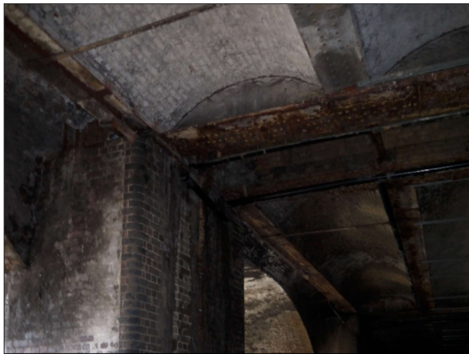
EXAMPLES OF DEGRADATION OF JACK ARCH BEAMS DUE TO WATER INGRESS FROM PARK LEVEL ABOVE - Please see Structural engineers report for description of required remedial works.